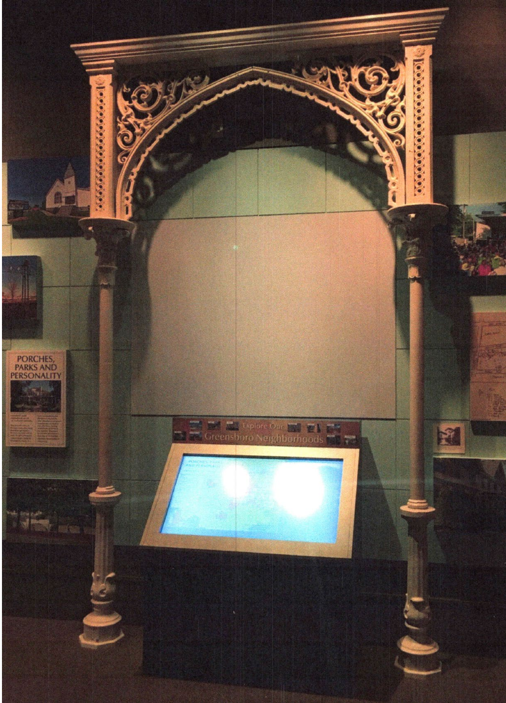
Photo 1: Dunleath Mansion Actual Ironwork - Greensboro Historical Museum